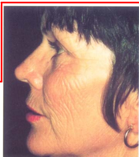
Before Laser Treatment

The newest and least risky peel is done by ultrapulse laser, which produces bursts of energy lasting less than a thousandth of a second that vaporize surface skin. Laser energy can be more precisely adjusted than chemicals that are brushed on and the results are excellent. Of course, such a happy outcome is likeliest from a practitioner experienced in using an ultrapulse laser. Of course, any doctor can legally buy a laser and do peel, so make sure your doctor has formal training and is a member of a national or international laser society.