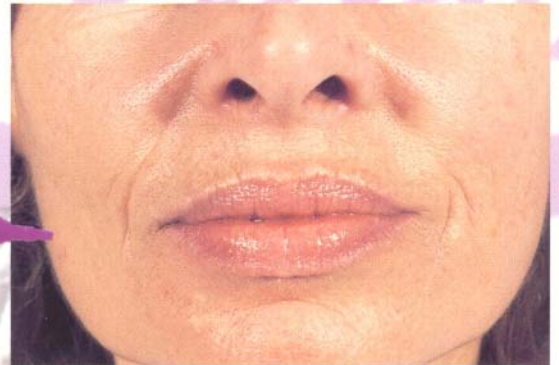
Smile lines before treatment

Dr. Sachs banishes wrinkles by placing a protein-based thread directly under the wrinkle line, where it stimulates local cells to "produce their own collagen." The thread dissolves over a period of six months leaving the wrinkle "filled in." The mini-operation takes about 10 minutes. Results last two to five years.